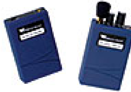
Williams Sound FM System