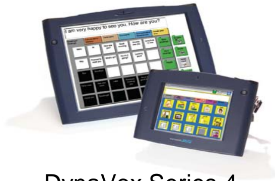
DynaVox Series 4