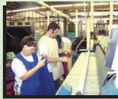
United Linen and Uniform Rental Tri County Technology Center, Bartlesville