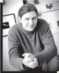
Christopher Nelson Autry Technology Center, Enid

Succeed in the workplace, in education and in life!