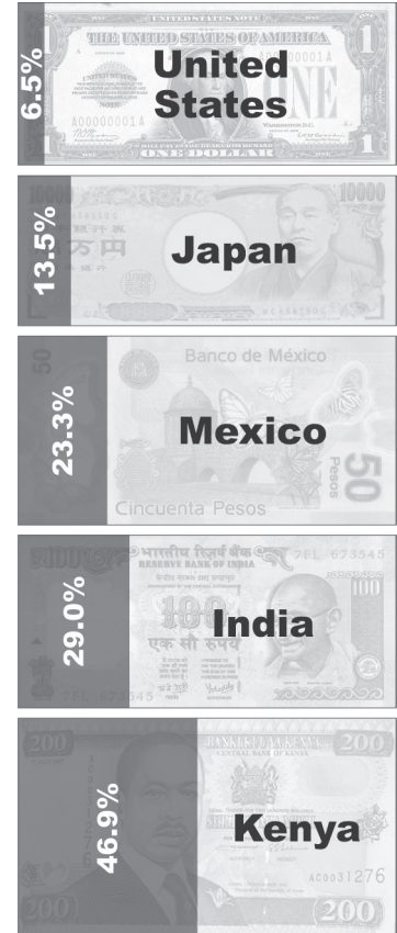
USDA-ERS Food Expenditures Data, Photos courtesy of Thinkstock Photos and Wikimedia Commons

To find the monthly amount available, multiply the yearly income by the percentage as a decimal. To change a percentage to a decimal, move the decimal point two places to the left. Then, subtract your answer from the original income and divide by 12 months. The answer is the amount this family has to spend on expenses other than food each month.